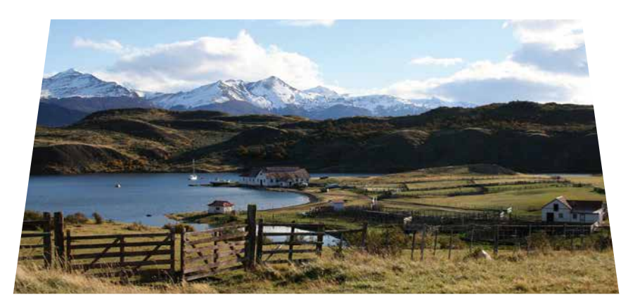
Puerto Natales Walk. Half Day – 1 hour – Low Difficulty

To understand how life goes by in the Provence of Ultima Esperanza (Last Hope) it is important to know the history of Puerto Natales and is inhabitants. Among other thing we will learn about how the city was built, the nature of its people as well as its traditions. We will visit different points of interest like Fishermen's Dock, City Council's Museum, Main Square and surrounding buildings.